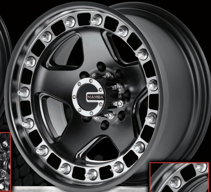
TYPE M4 RWD Matte Black & Diamond-Cut 17x8, 18x9, 20x9, 20x10, 22x9.5