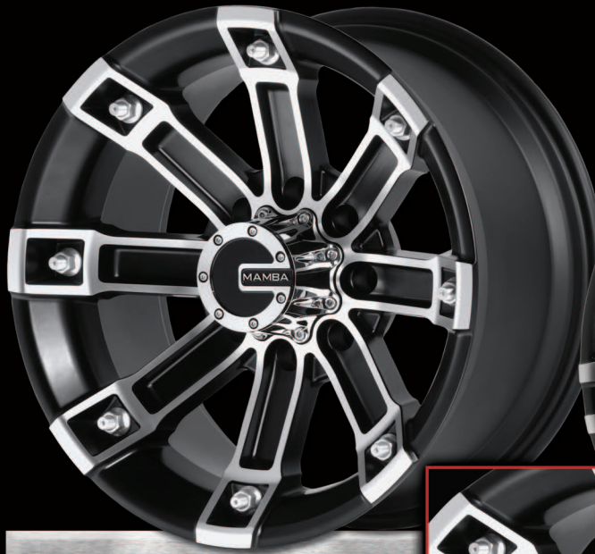
TYPE M1 RWD Matte Black & Diamond-Cut 17x8, 18x9, 20x9, 20x10, 22x9.5