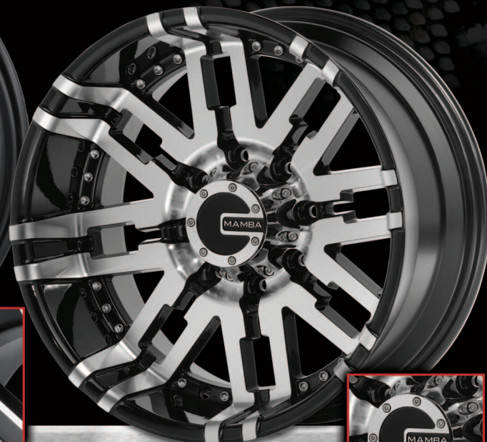
TYPE M2 RWD Gloss Black & Diamond-Cut 17x8, 18x9, 20x9, 20x10