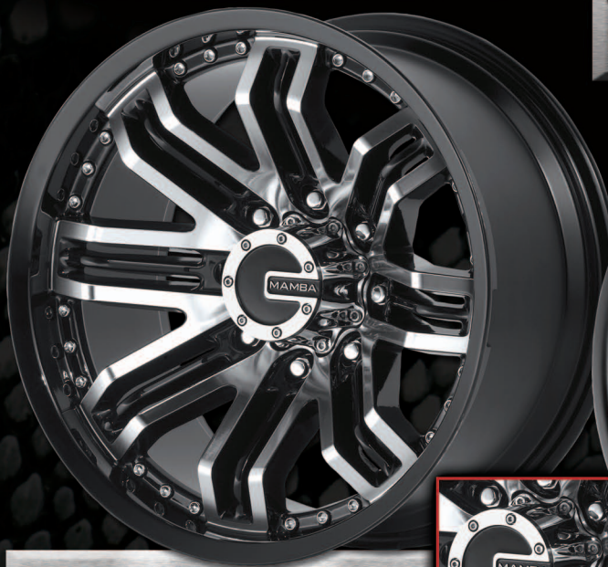
TYPE M3 RWD Gloss Black & Diamond-Cut 17x8, 18x9, 20x9, 20x10